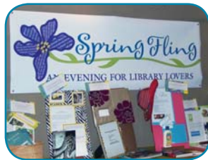
Spring Fling Success!