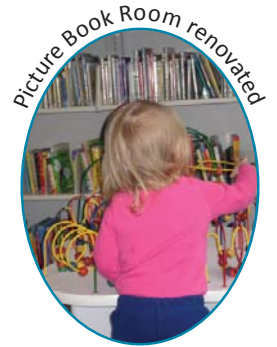
Picture Book Room renovated