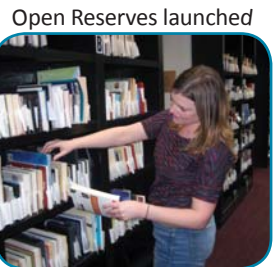
Open Reserves launched