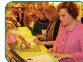
Spring Fling fundraiser