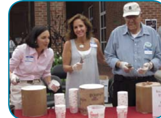
Get the Scoop @ the Library